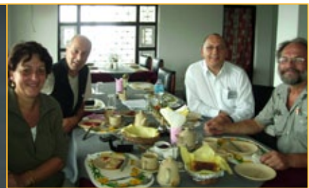
→ TEAMPHOTO :)